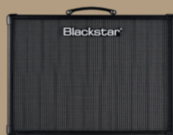
BLACKSTAR ID:Core STEREO 100 COMBO £249

WHAT IS IT? Programmable, solid-state/digital 2x10 combo with 2x 50-watt stereo power