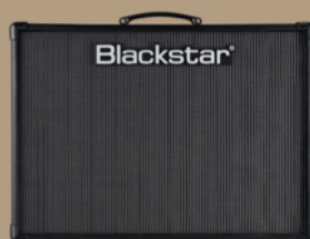
BLACKSTAR ID:Core STEREO 150 COMBO £329

WHAT IS IT? Programmable, solid-state/digital 2x10 combo with 2x 50-watt stereo power