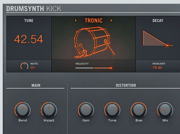
The five dedicated drum/percussion synths give just the right amount of control and sound superb