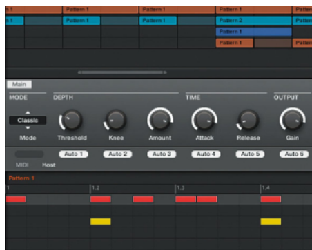
At long last, plugin hosts can send automation data direct to instrument/effect parameters in Maschine!

The overview/zoom arrangement continues into Pattern and Sample Edit modes, where the screens obviously blow Maschine/Mikro's out of the water, mirroring the Maschine GUI 1:1 and facilitating in-depth editing of patterns and samples without so much as a glance at your computer monitor. Selecting notes is still a fiddlier process using Maschine's knobs than it is with a mouse, but seeing your pattern and sample edits happen in real time on the