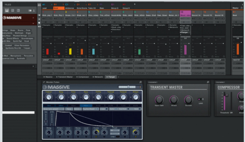
The Mix view offers full signal control, routing and plugin editing in one convenient window