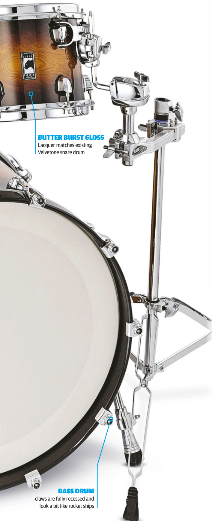
BUTTER BURST GLOSS Lacquer matches existing Velvetone snare drum

£2,210 Mapex's logical extension to its hugely successful snare range is the Black Panther kit, says Geoff Nicholls