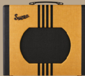
SUPRO DELTA KING 12 1X12 COMBO £599

WHAT IS IT? A slightly modified version of Supro's 2019 Blues King that blends vintage styling and single-ended vintage Class A tone with a modern preamp that adds great versatility