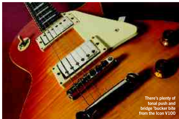
There's plenty of tonal push and bridge 'bucker bite from the Icon V100

ICON V100 Epiphone Les Paul 100 £299 Cruiser LS950 £199 Gould GS240 £185 Epi's LP100 has an alder top, but performance is pretty close to that of a 'real' LP. More of a Custom than a Standard, the LS950 provides the classic arctic white Les Paul vibe at a fraction of the price. Gould's slimmed-down basswood body model is a good example of quality on a budget from the Orient