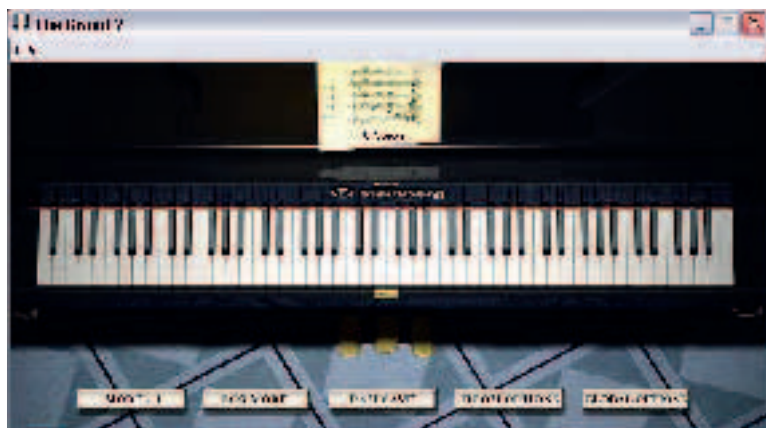
▲ The Grand 2 incorporates two soundbanks – one old and one new

The new piano sounds great at both ends of the scale and has a rich tone that extends right down to the