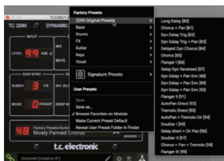
A good range of presets are included, including all those from the original 2290 and various artist contributions

Sadly, though, the controller brings with it a couple of major issues. First, the buttons. While they're great for precise adjustments, they're far