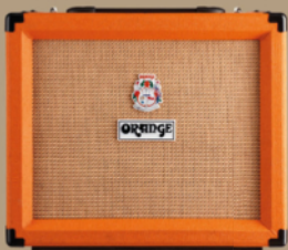
ORANGE ROCKER 15 £599

WHAT IS IT? All-valve, EL84-powered 1x10 combo with valve-buffered effects loop and flexible power switching