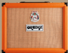
ORANGE ROCKER 32 £829

WHAT IS IT? All-valve, EL84-powered 1x10 combo with valve-buffered effects loop and flexible power switching