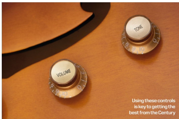
Using these controls is key to getting the best from the Century

ragged character for rock rhythm. Unsurprisingly, the Century is happiest strummed and picked up and down its C-shaped neck over cleaner ground, pushed with light gain in places. Trying some blues licks, we experience that tension from the bridge design and the wound G string. Whole tone bends aren't given for free (we find it friendlier in E b ) but it inspires more muscle from your approach.