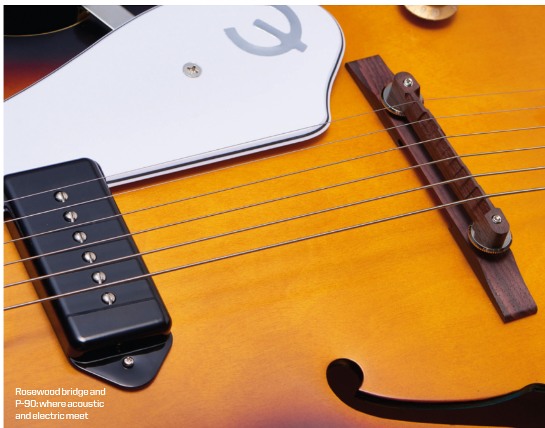
Rosewood bridge and P-90: where acoustic and electric meet

The Pro is not the hottest P-90 we've encountered, but this is a hollowbody and feedback is a consideration. Move into medium gain and things can get wooly in the bottom end, but pitch your amp's treble right and there's