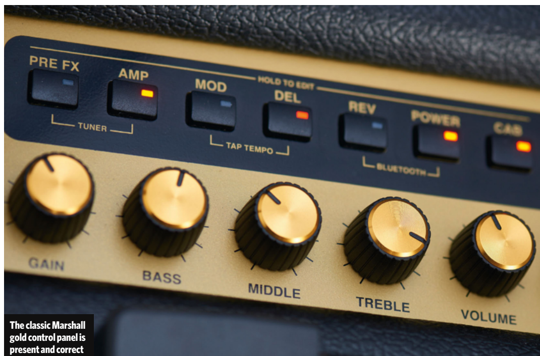
The classic Marshall gold control panel is present and correct

The tones are at least as good as the competition, and although streaming music into the amp via Gateway or USB sounds okay, you face the limitation that the amp speakers are for guitar, not full-range hi-fi. As you might expect from a Marshall, the CODE50 is loud and very giggable, with plenty of clean headroom as