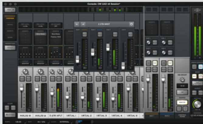
The Console 2.0 mixer now has floating sends and a better UI