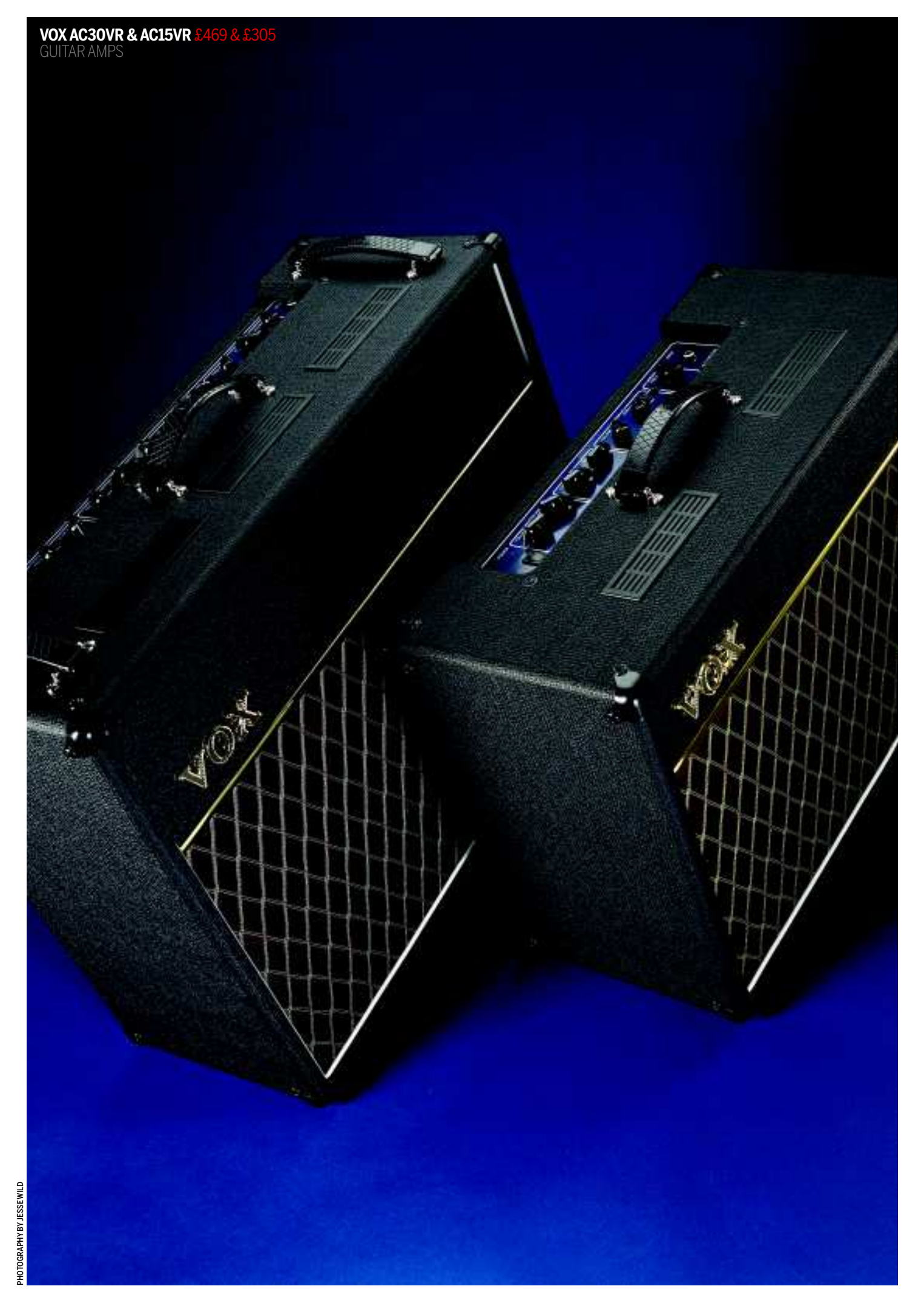
128 Guitarist May 2010