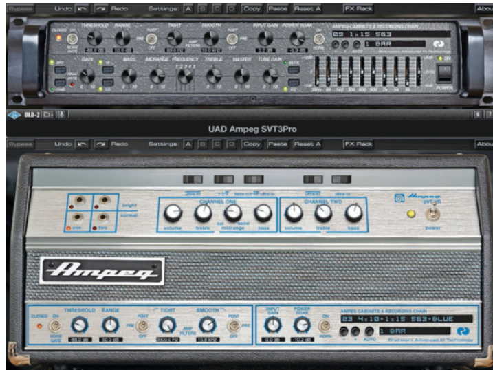
There's masses of bass-focused sound-shaping possibility on offer in both Ampeg emulations

As is becoming traditional with Brainworx software, the amp is enhanced by an FX section, which can be toggled on/off via the FX Rack button in the plug-in's control section. This provides a Noise Gate and Filter in its bottom left-hand corner, both of which are effective for reducing amp noise if things get out of hand. Meanwhile, the bottom right-hand corner lets you choose from a variety of cabinet settings and recording chains, which pair cabs to modelled microphone recording channels. There's also a Power Soak option to attenuate cranked treatments