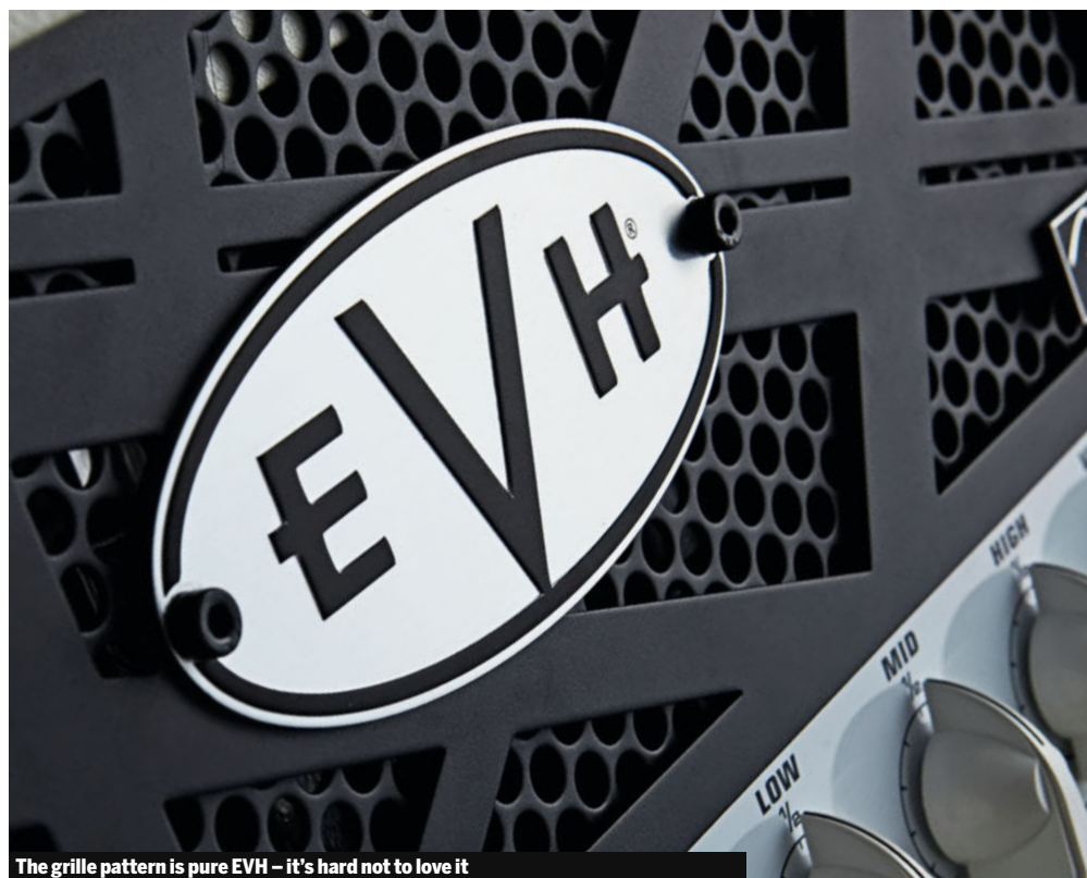
The grille pattern is pure EVH – it's hard not to love it

footswitchable crunch button on its cleaner channel, and maybe that would have been a better option here.