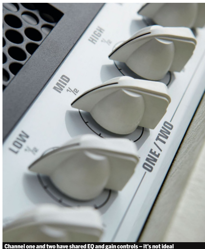
Channel one and two have shared EQ and gain controls – it's not ideal

30s. It's worth mentioning that a 1 x 12 cab is also available, albeit without the tilt-back array and, as a package, the rig looks wonderful: simply check out Ed's backline in the video that accompanies VH's new single, Tattoo, for proof.