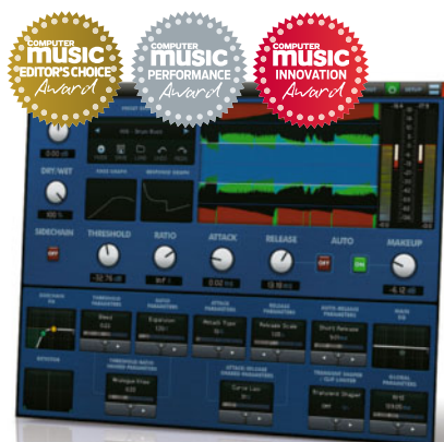
DMGAudio PC MAC Compassion £150