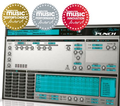
Rob Papan PC MAC Punch £125

What is it? The most flexible dynamics processor we've ever encountered, this awesome plug-in is capable of compression, expansion, transient shaping, clipping/limiting, and more. The easy mode presents just the basic dynamics parameters, but activate the advanced mode and you can radically reshape Compassion's dynamic response with over 80 parameters. Oh yeah, and it sounds incredible! Verdict "An outstanding musical dynamics tool that's a jack of all trades - and a master of most."