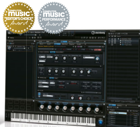
Steinberg PC MAC HALion 4 £295

What is it? A forward-thinking virtual drum machine combining synthesis, sampling and innovative sequencing. As you'd expect from Rob Papan, the preset sounds are top-drawer, with some equally high-flying effects to back them up. The sequencer packs a similar, er, punch, with a crafty scheme whereby each pattern is made up of four drum tracks, with eight patterns stackable at once. Verdict "Another winner from the Papan stable, Punch sounds awesome and is fair bursting with powerful features."