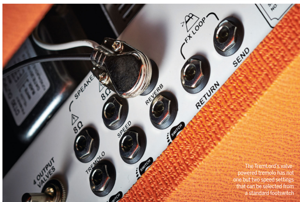
The TremLord's valve-powered tremolo has not one but two speed settings that can be selected from a standard footswitch

We're really impressed with Orange's non-standard choice of loudspeaker, too – the Lavoce's big magnet and voice coil mean it's never likely to be under any stress, yet when pushed with a decent level it sings in a way that high-powered loudspeakers often don't. Some loudspeakers derived from PA designs reveal every fluffed note with ruthless efficiency, but the Lavoce is forgiving and guitar-friendly, flattering your tone with a smooth bass roll-off, warm midrange and crisply detailed high frequencies. It also benefits from an impressive 99dB sensitivity that lets the TremLord punch well above its weight in the volume stakes.