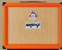
ORANGE TREMLORD 30 1X12 COMBO £999

..... WHAT IS IT? 1950s-style amplification: a clean machine with no preamp gain controls, a traditional spring reverb and a superb valve-powered tremolo