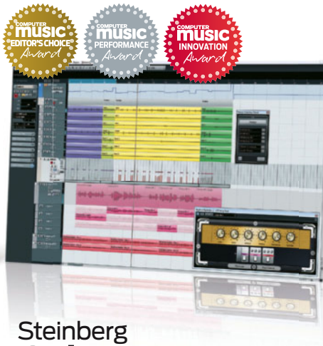
Steinberg Cubase 6 £508 PC MAC

Verdict "Philta XL lends further credibility to Vengeance-Sound's status as lords of the dance scene. It's a certified banger!"