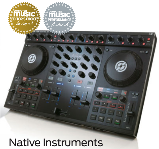
Native Instruments Traktor Kontrol S4 £749 PC MAC

Verdict "An all-round update for an all-round great DAW, combining sensible additions and tweaks with splashes of real innovation"