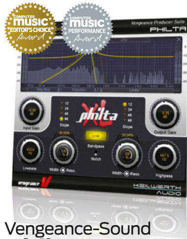
Vengeance-Sound Philta XL £40 PC MAC