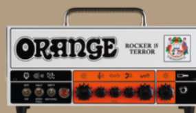
ORANGE TERROR ROCKER 15 HEAD £549

WHAT IS IT? Terror 'lunchbox' format of of Orange's very versatile Rocker 15 combo