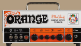
ORANGE BRENT HINDS TERROR HEAD £569

WHAT IS IT? Terror 'lunchbox' format of of Orange's very versatile Rocker 15 combo