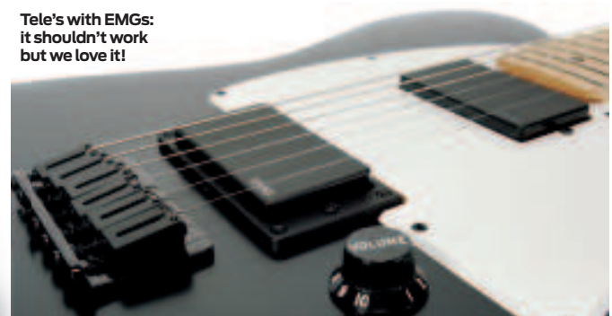
This axe features a set of locking Schaller heads

Tele's with EMGs: it shouldn't work but we love it!