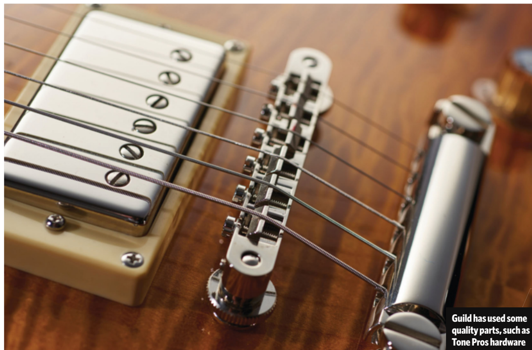
Guild has used some quality parts, such as Tune Pros hardware

Plugged in, however, we're in for a treat with a classic pair of USA Seymour Duncan pickups that