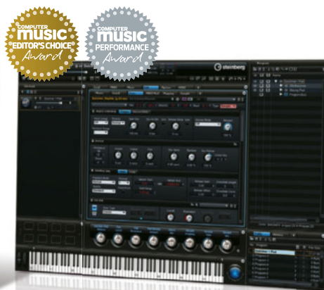
Steinberg HALion 4 £295

Verdict "Another winner from the Papen stable, Punch sounds awesome and is fair bursting with powerful features."