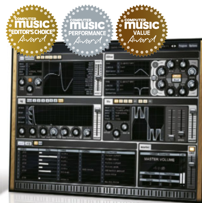
Cakewalk Z3TA+ 2 £69

Verdict "HALion 4 proves to be well worth the wait, though only time will tell if it can regain its status as a first-tier sampler."