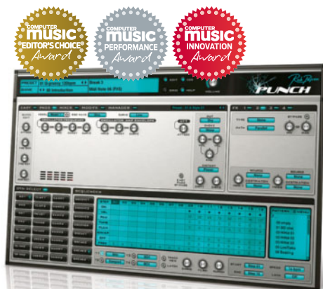
Rob Papen Punch £125