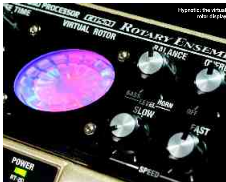
Hypnotic: the virtual rotor display

Full of innovative and authentic features, the four modes plus their overdrives sound wonderfully realistic