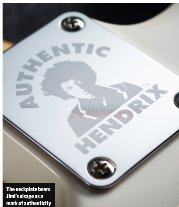
The neckplate bears Jimi's visage as a mark of authenticity