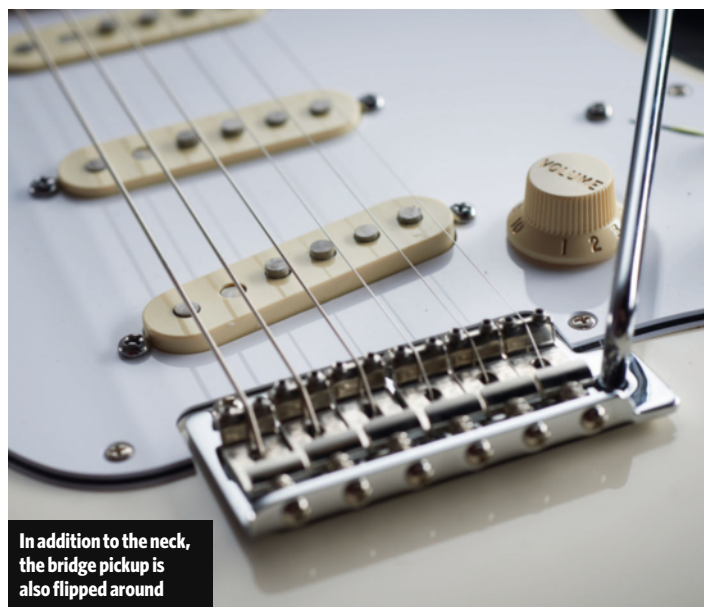
In addition to the neck, the bridge pickup is also flipped around

works best where it is. As for those harder-to-reach tuners, it's a small price to pay for the tonal treasure. Besides, this Strat never lost its tuning once, and we played it a lot.