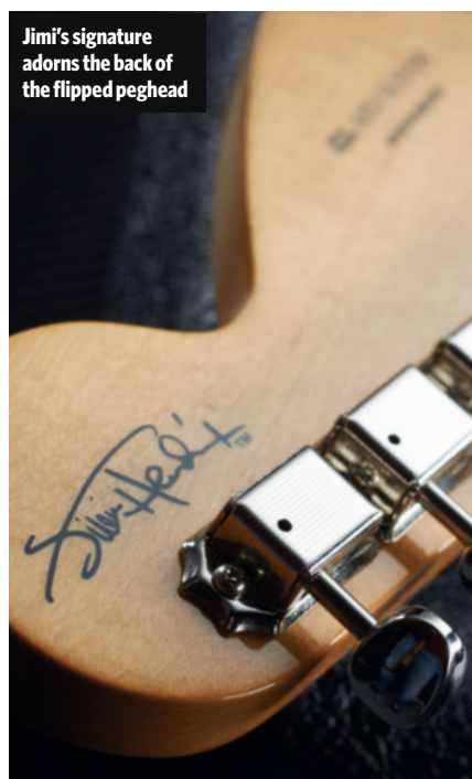
Jimi's signature adorns the back of the flipped peghead

While some have grumbled, we're glad the vibrato arm position wasn't reversed. Hendrix-mad Stevie Ray Vaughan was a fan of that modification, but we reckon it