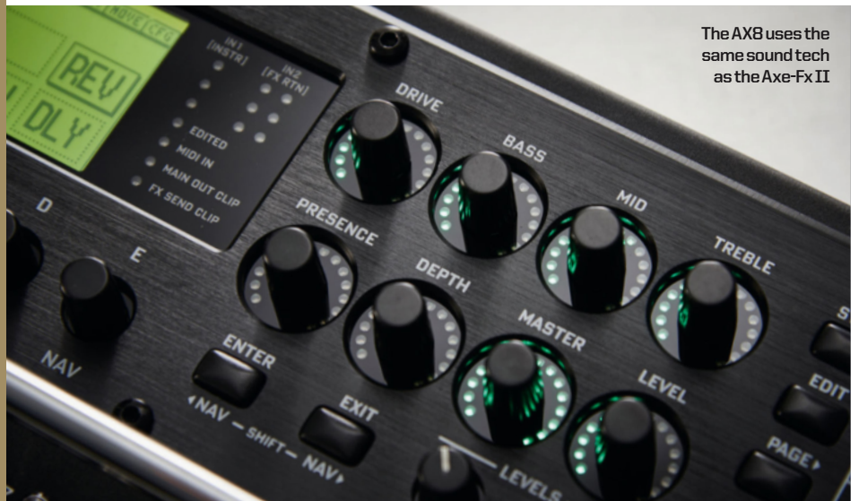
The AXB uses the same sound tech as the Axe-Fx II