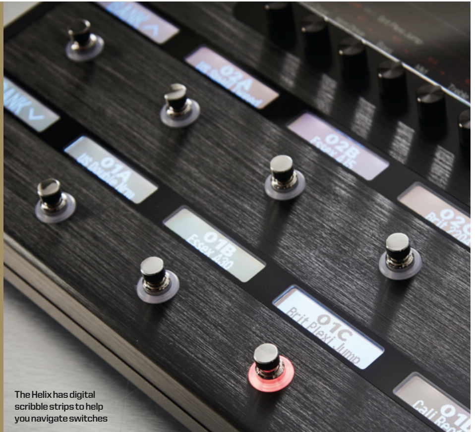
The Helix has digital scribble strips to help you navigate switches

The Positive Grid BIAS Head essentially functions as a zero-latency and very high-quality hardware front-end for the BIAS Amp Pro software. The 600-watt power stage means that the BIAS Head is the only one of the quartet that can connect directly to a loudspeaker, although the Kemper can be bought with a similar integral amplifier. We like the BIAS Head's gutsy crunch tones and dynamic, ripping high-gain leads, while the wireless connectivity makes iPad or iPhone hook-up a piece of cake.