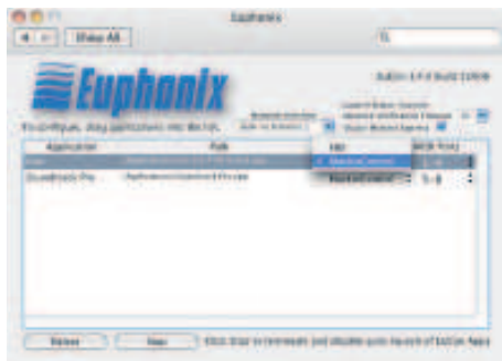
Configure the MC Mix to work with Mackie Control- and HUI-compatible systems in the preferences window

Dig a bit deeper and you'll discover alternative ways to view your data, including channel mode, which lays out the inserts of one channel across all eight rotary encoders. Alternatively, activating flip mode enables the faders to control plug-in parameters. However, getting the most out of the MC Mix requires an understanding of the detailed OLED display strip. Beyond the obvious (level meters, track naming,