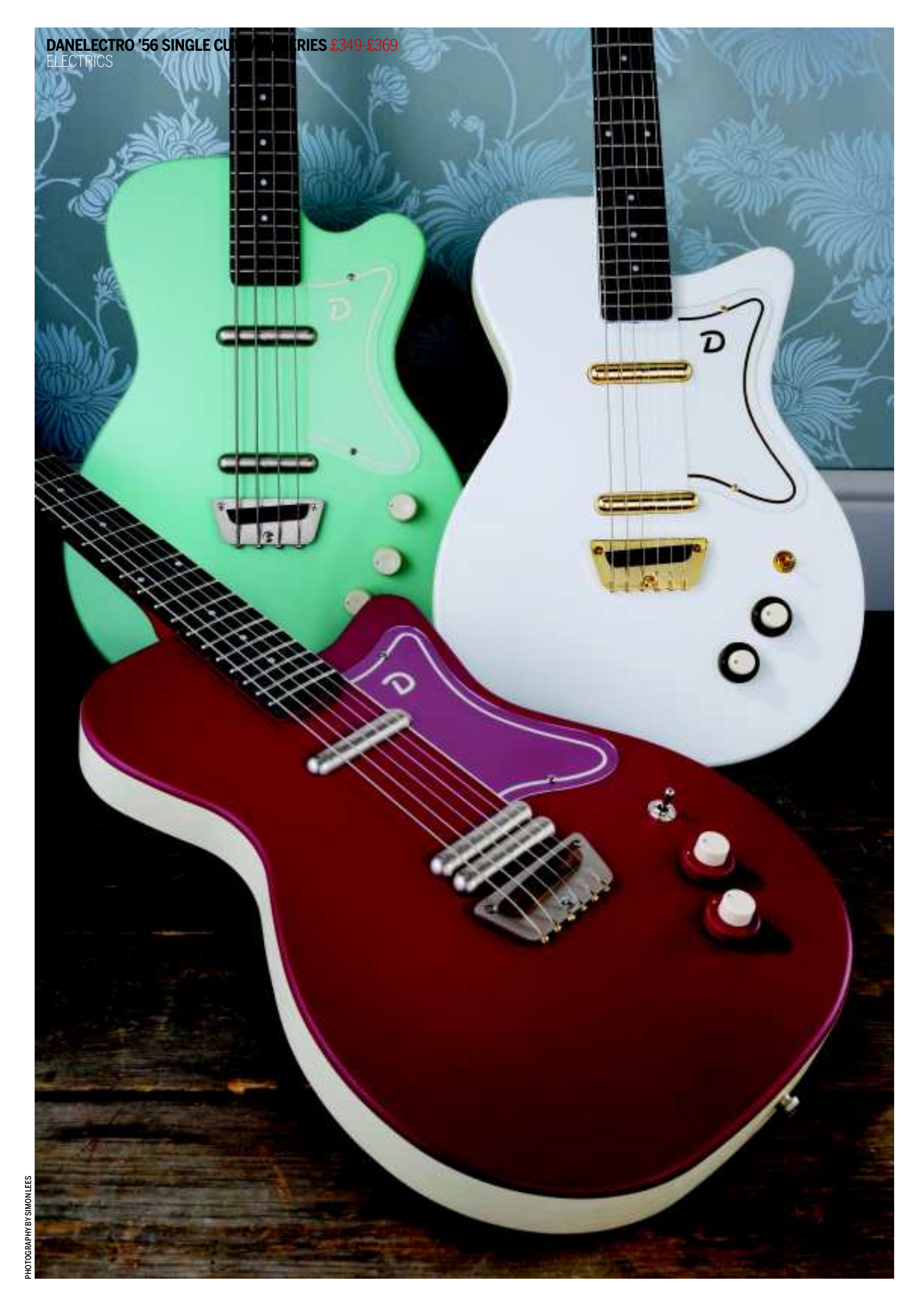
86 Guitarist April 2011