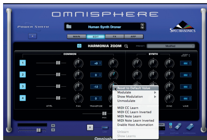
Create monstrous patches of up to 10 sounds at once, now with zoom functions

Again assigned to its own dedicated zoomed page, this employs granular synthesis techniques to break sounds up into tiny pieces and then rearrange