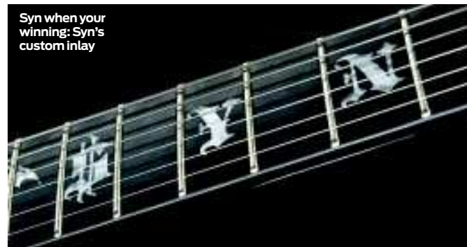
Syn when your winning: Syn's custom inlay

TG says... Synyster? It's bloody terrifying