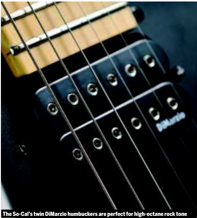
The So-Cal's twin DiMarzio humbuckers are perfect for high-octane rock tone

Guitarist says: All that separates this from the deleted US models is the price; great rock tone, high spec and the Hollywood vibe remain. At this price, you must seriously consider one