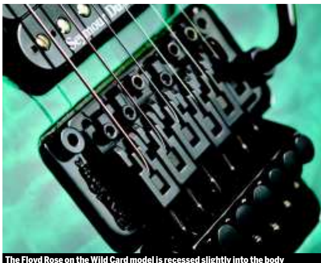
The Floyd Rose on the Wild Card model is recessed slightly into the body