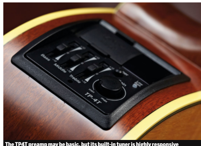
The TP4T preamp may be basic, but its built-in tuner is highly responsive

The EG50TH is typical Takamine: an extremely competent electro-acoustic