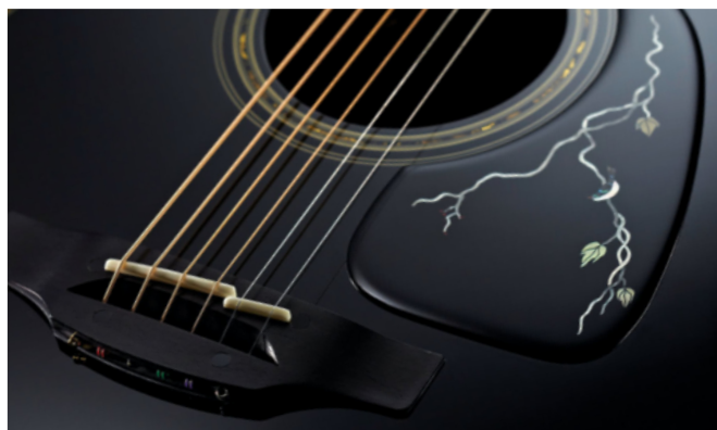
The black-on-black scratchplate exudes class, even if it looks too good to touch

craftsmanship exudes quality. The EG50TH is good, but it's not in the same league.