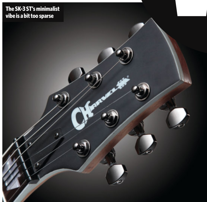
The SK-3 ST's minimalist vibe is a bit too sparse