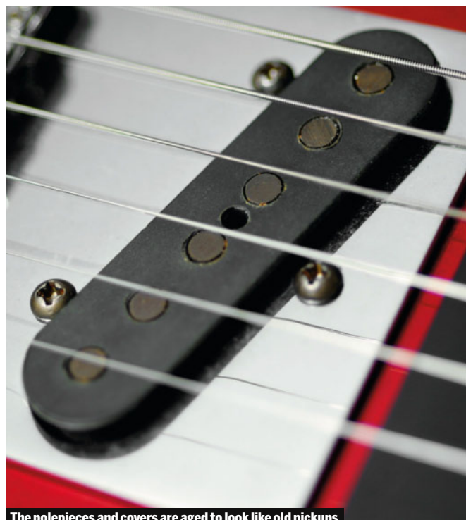
The polepieces and covers are aged to look like old pickups

You'll find those flatter fingerboards, bigger frets and worn-in necks really do improve playability