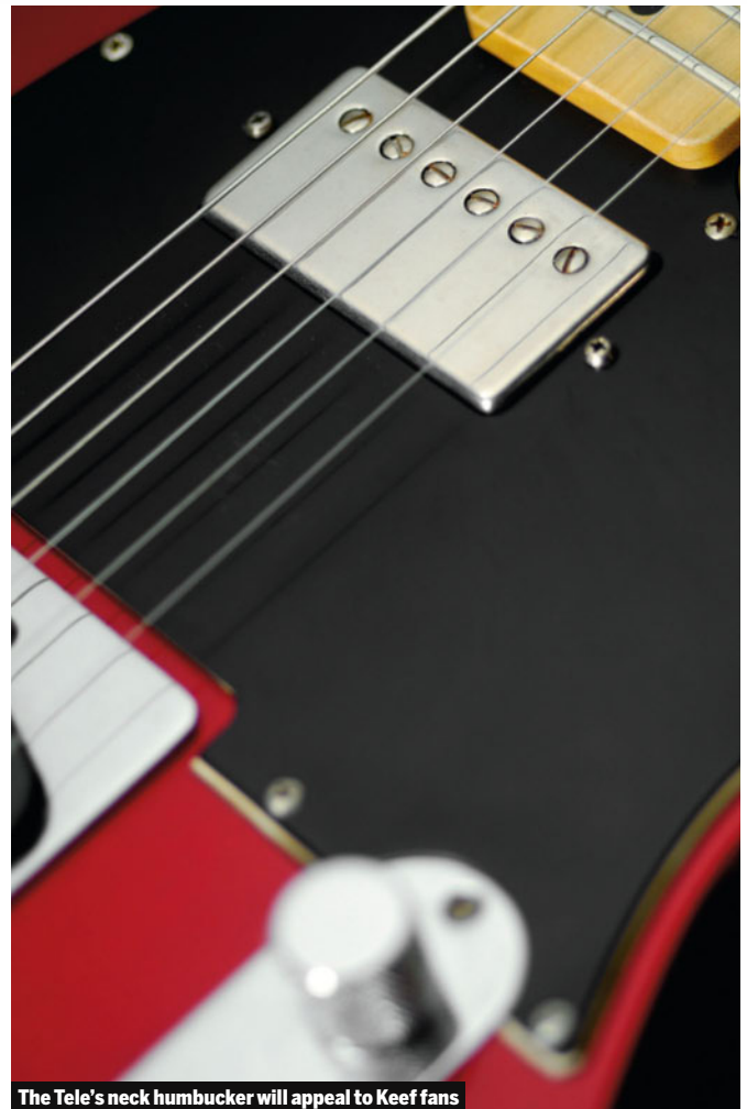
The Tele's neck humbucker will appeal to Keef fans

There's no doubt the lack of finish on the Strat fingerboard keeps this guitar from being brittle-bright