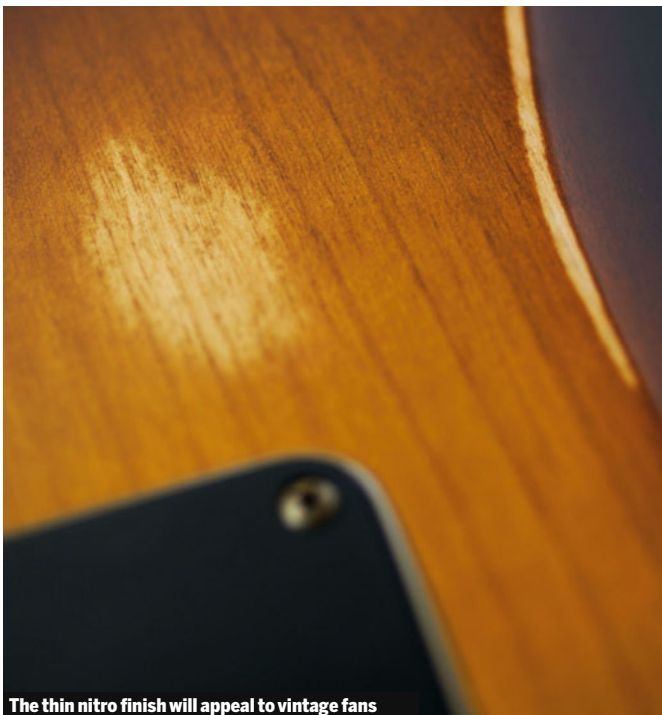
The thin nitro finish will appeal to vintage fans

almost-matte nitrocellulose top coat that's been mechanically aged to simulate a few years' heavy use. It's not convincing in a vintage guitar sense – the Tele is marginally more 'authentic' than the Strat here – but Fender is the first to point out that nobody is trying to fool you that these are old guitars; they just ape the feel of well-played instruments and, yes, look a bit vintage from afar.