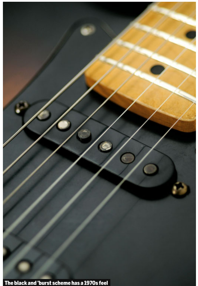
The black and 'burst scheme has a 1970s feel

The tuners are the die-cast square-button type with through-post stringing, rather than the split-shaft vintage type. The headstock has a