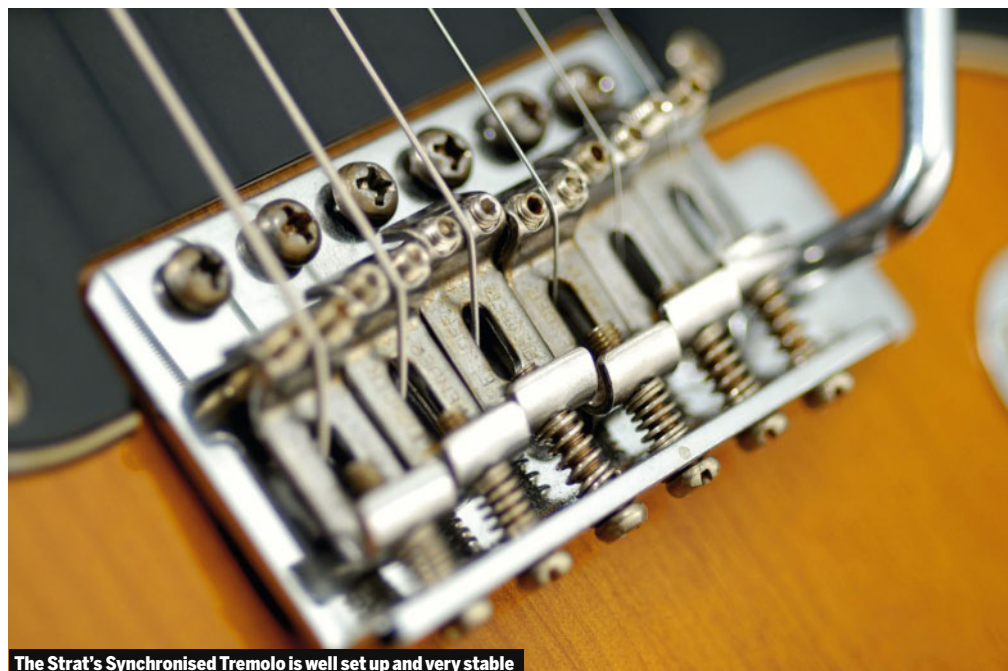
The Strat's Synchronised Tremolo is well set up and very stable

The ESP LTD Distressed Series is a good mid-price start, including the Tele-inspired TE-202 (£419.99) with almost identical spec to the Road Worn Player, but with an extra fret and proprietary pickups. The ST-203 (£419.99) is a rosewood-board, SSS Strat derivative. Both are aged. There's also the more upmarket ESP Vintage Plus S-type at £1,639.99. For a more budget choice, check out the Vintage Icon Series . Not up to Fender's tone or build quality, but fun nonetheless. The V6HMR (£349) is the maple-necked SSS model, while the V52MRBS is the maple-necked T-type. There's no neck humbucker option.