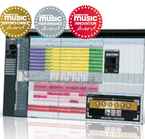
Steinberg Cubase 6 £508 PC MAC

Verdict "Philta XL lends further credibility to Vengeance-Sound's status as lords of the dance scene. It's a certified banger!"