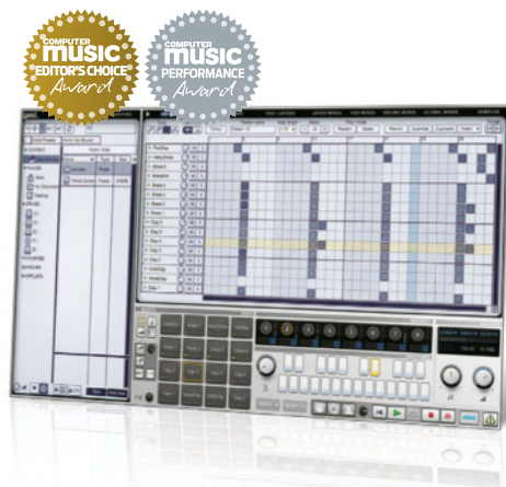
FXpansion Geist £189 PC MAC