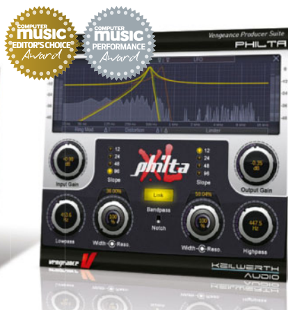
Vengeance-Sound Philta XL £40 PC MAC

Verdict "Geist is one of the best virtual drum machines around and will more than satisfy those who've been waiting patiently for a Guru sequel"