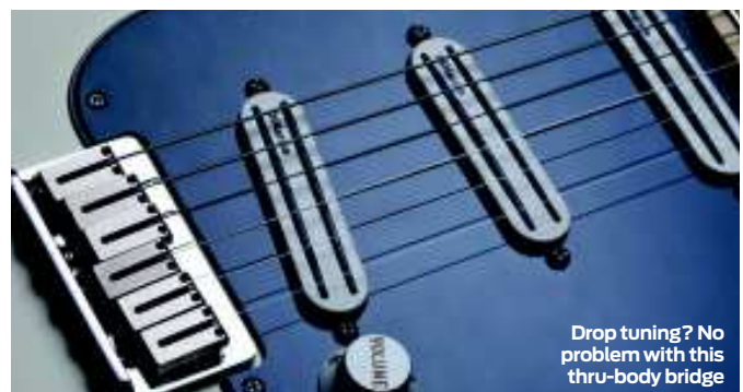
Drop tuning? No problem with this thru-body bridge

"CORGAN'S BESPOKE NECK AND BRIDGE PICKUPS ARE PERFECT FOR PUMPKINS MOMENTS AND YOUR OWN ALT ROCK CLASSICS"