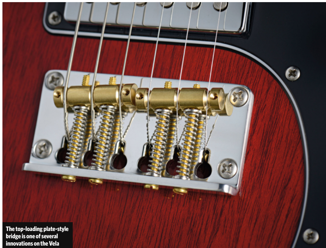
The top-loading plate-style bridge is one of several innovations on the Vela

Underpinned with its resonant, all-mahogany construction and set neck, there's a relative roundness and thickness (certainly when compared with a Stratocaster), which works just as well for retro styles as it does under heavier, effects-laden gain. There's something about this tonal balance that makes for a really good slide guitar tone, too, not least with