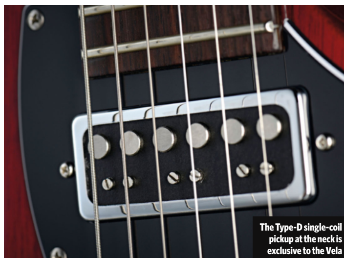
The Type-D single-coil pickup at the neck is exclusive to the Vela

some power amp gain and that Type D single coil.