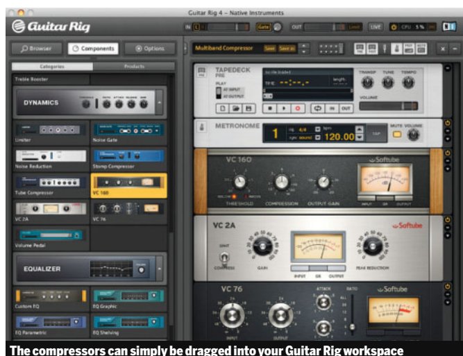
The compressors can simply be dragged into your Guitar Rig workspace