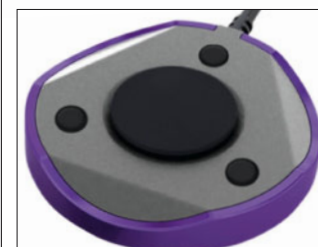
The transducer sits atop your guitar