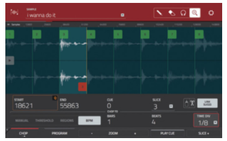
Touchscreen editing makes the MPC Touch the most welcoming Music Production Center ever

It's not all tactile fun and games though. We're disappointed (but not surprised) that there's no access to third-party plugin GUIs via the touchscreen, and browsing for new samples outside the current project is even more