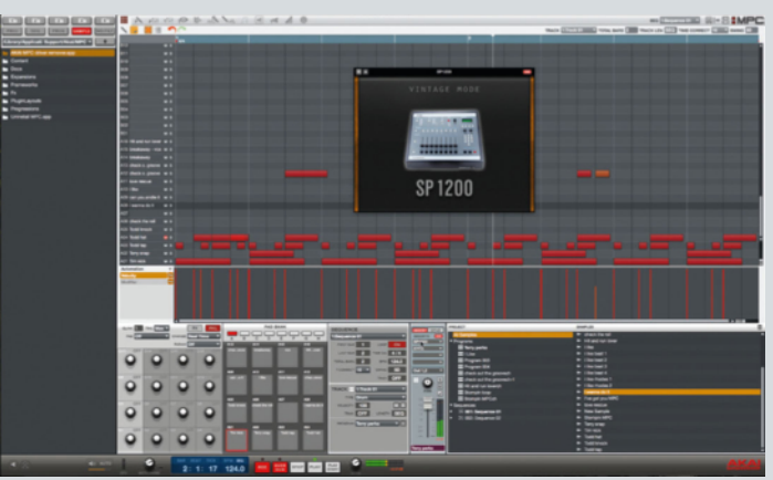
MPC Software is looking a bit tired, but that doesn't hold back its lightning-fast workflow