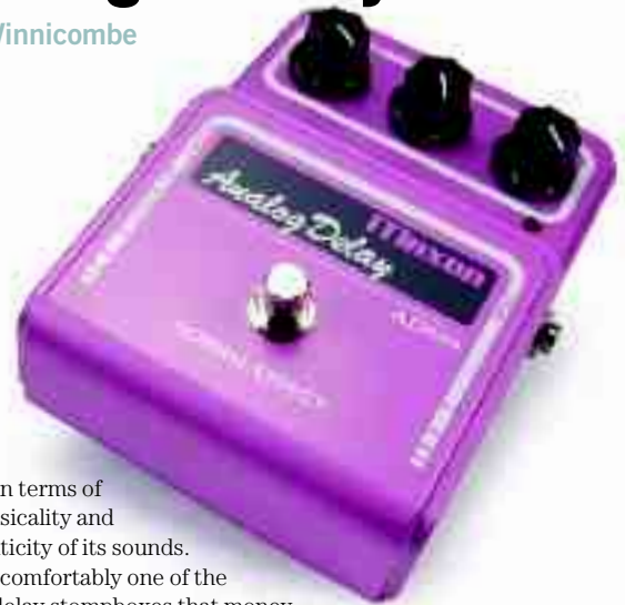
Maxon AD999: a cut above

While digital emulations from the likes of Line 6 come admirably close to capturing the character of this kind of effect, this analogue unit really is a cut