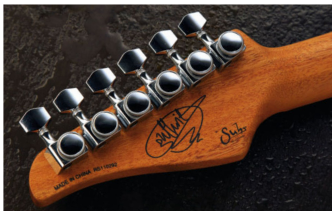
The Gotoh locking tuners are another example of the GG's high-spec approach