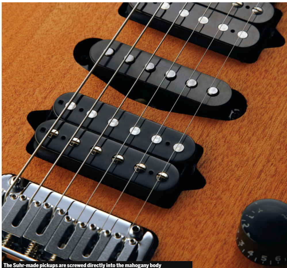
The Suhr-made pickups are screwed directly into the mahogany body

steel licks. We also can't get enough of the glassy 'Jimi' tone of the split neck 'bucker. At every click of the switch the Rasmus just sounds so alive.