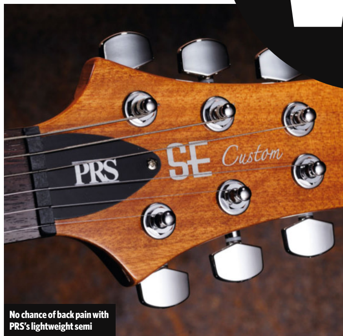
No chance of back pain with PRS's lightweight semi