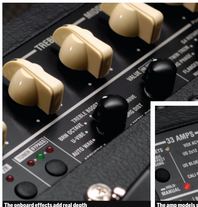
The onboard effects add real depth