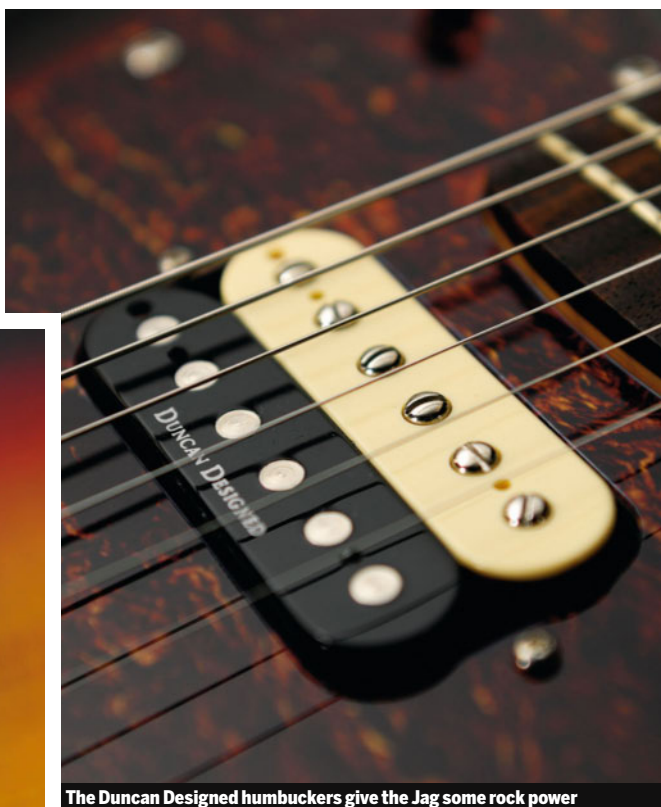
The Duncan Designed humbuckers give the Jag some rock power