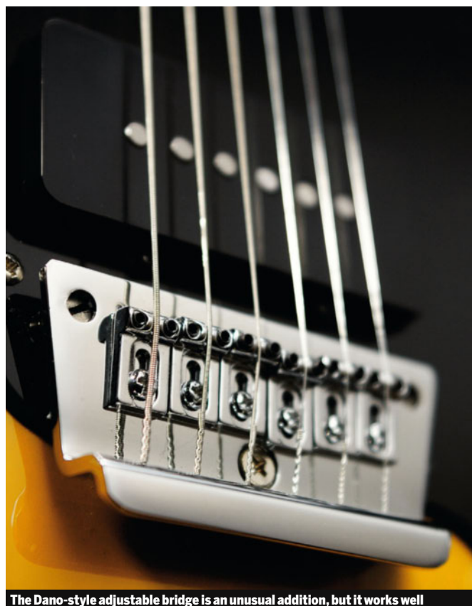
The Dano-style adjustable bridge is an unusual addition, but it works well

There's not much in it really and we are equally impressed with the performance of both guitars