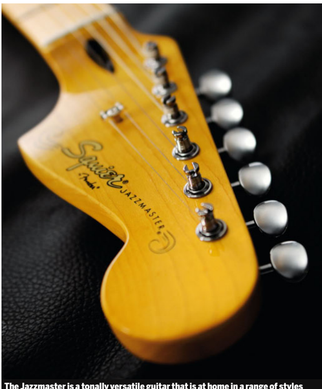
The Jazzmaster is a tonally versatile guitar that is at home in a range of styles

Kurt Cobain played a '65 sunburst Jag with DiMarzios, and that sums up the player Fender is trying to hook here