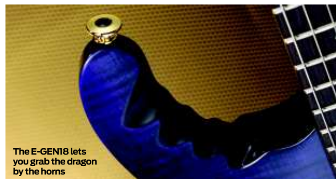
The E-GEN18 lets you grab the dragon by the horns