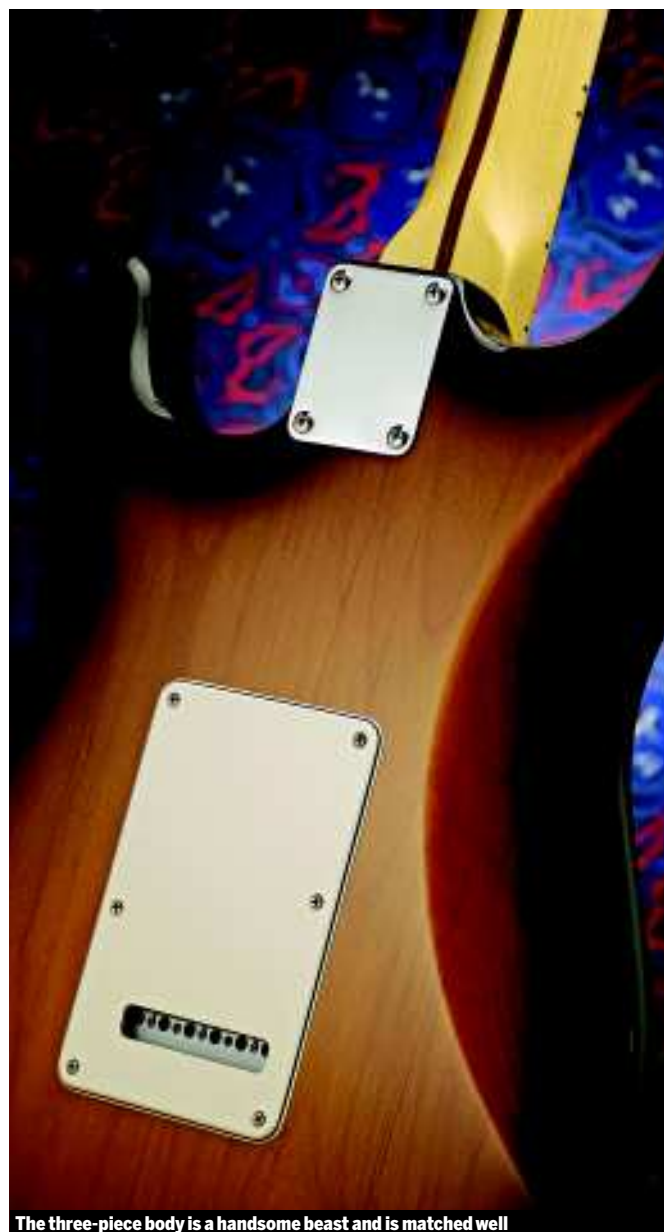
The three-piece body is a handsome beast and is matched well

The [Special Strat] is so willing and versatile that it would be at home in even the most professional situation