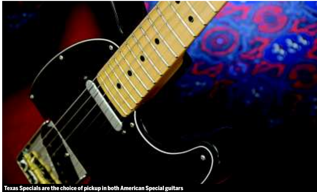
Texas Specials are the choice of pickup in both American Special guitars

Fender's Road Worn '50s Telecaster (£859) comes with aged neck, body and hardware. A cool-as-you-like vibe, it's a real hit. More sophisticated is Blade's Sen ash-bodied T2-RG Delta Classic (£699) with Variable Spectrum Control for broad tonality, gold hardware and smart finish colours.