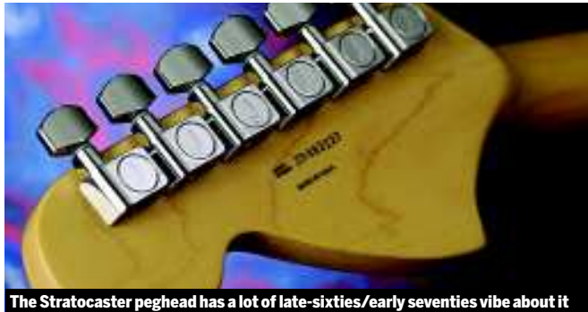
The Stratocaster peghead has a lot of late-sixties/early seventies vibe about it

Gallagher's mantra of 'let's go to work' as its own.