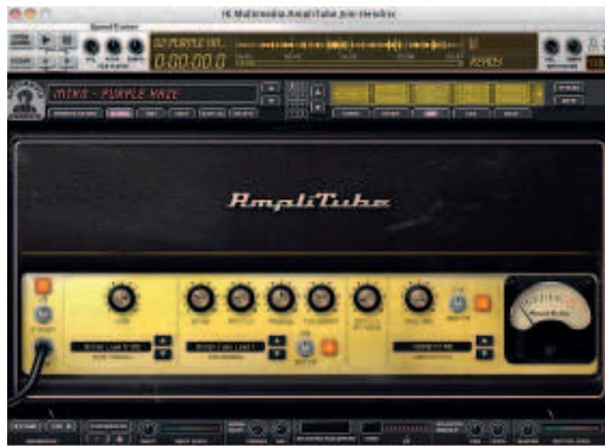
Above: this software is a specialised version of the popular AmpliTube software