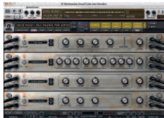
Above: It's a shame there's no delay effect Above right: settings from individual parts to Hendrix songs can be called up

→ began with the amps, speakers, effects and microphones modelled here, much of what you finally hear on record owes a lot to the effects added in the studio, some of which are sadly lacking here. We get the basic compression, EQ and reverb effects that every studio has, plus a simulated Leslie cabinet, but none of the tape-based effects that Eddie Kramer manipulated so well. How difficult would it have been to include a tape delay simulation here? There are obvious delay sounds in many of Jimi's recordings. And while the Univibe does a phasing effect, it is different from the phasing produced by manipulating the tape reel flanges clearly heard in tracks like House Burning Down. A missed opportunity, especially since AmpliTube 2 has a digital delay and flanger in the rack that could perhaps be adapted. Apparently IK does intend to add