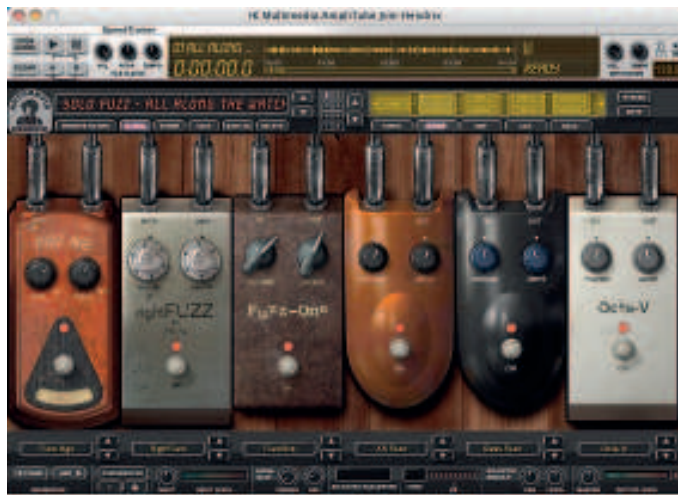
Above: five fuzz pedals feature, plus Univibe, Octavia and tremolo effects