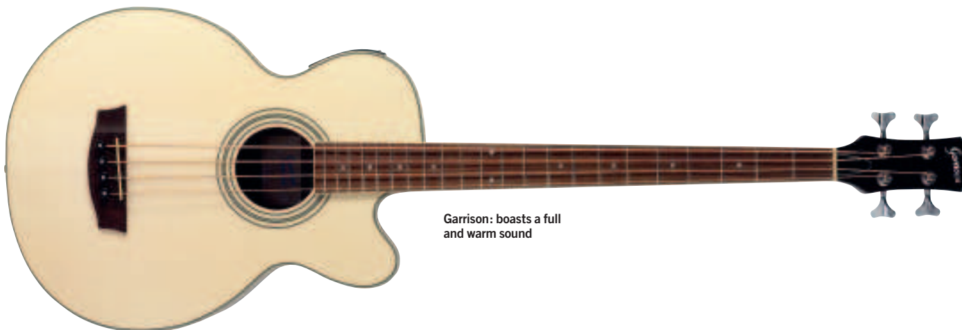
Garrison: boasts a full and warm sound