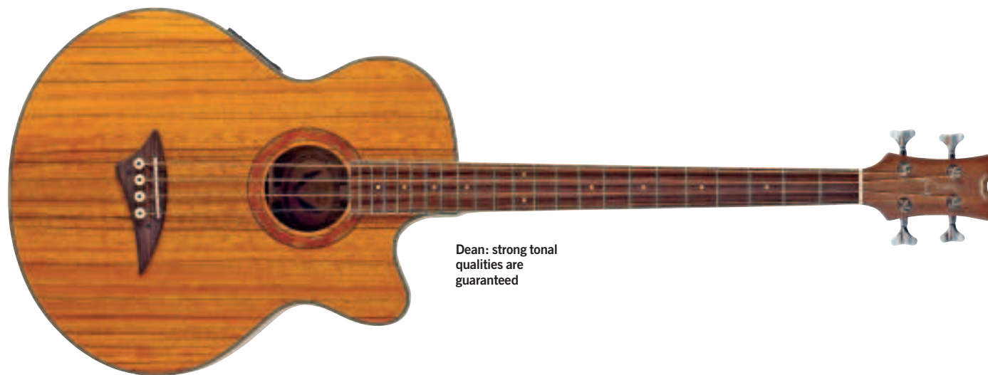
Dean: strong tonal qualities are guaranteed

GARRISON AG/AB FOUR-STRING PRICE: £349 ORIGIN: China TYPE: Electro-acoustic hollowbody bass SCALE LENGTH: 864mm (34-inches) WOODS: Select spruce top, mahogany back & sides ELECTRICS: Pro Elo-Acou ATE-4 – four-band EQ, volume Aria 0208 572 0033 www.garrisonguitars.com