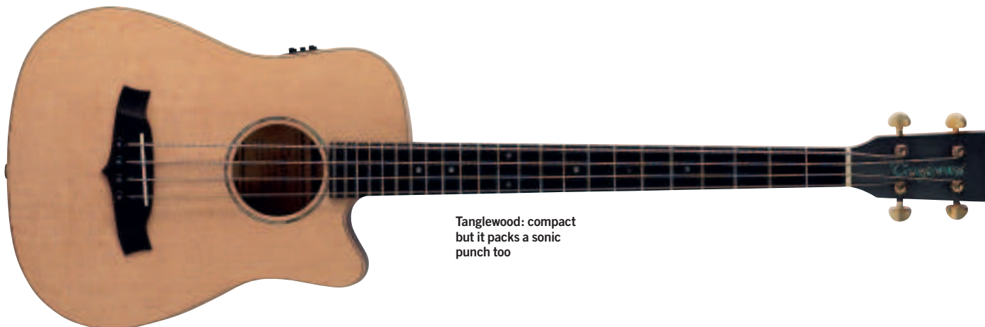
Tanglewood: compact but it packs a sonic punch too