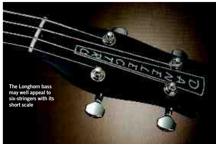
The Longhorn bass may well appeal to six-stringers with its short scale

If you love the Longhorn look but want a high-end feel then Nashville's Jerry Jones can be found at www.jerryjonesguitars.com ; there are a plethora of finish options too. Fender's Mustang bass makes a welcome return for 2006 and is one of the coolest looking, and most popular, short scale basses of all time. Finally, for that Jackson Five/Jack Bruce vibe and a whole lot more, check out the Epiphone EB-0