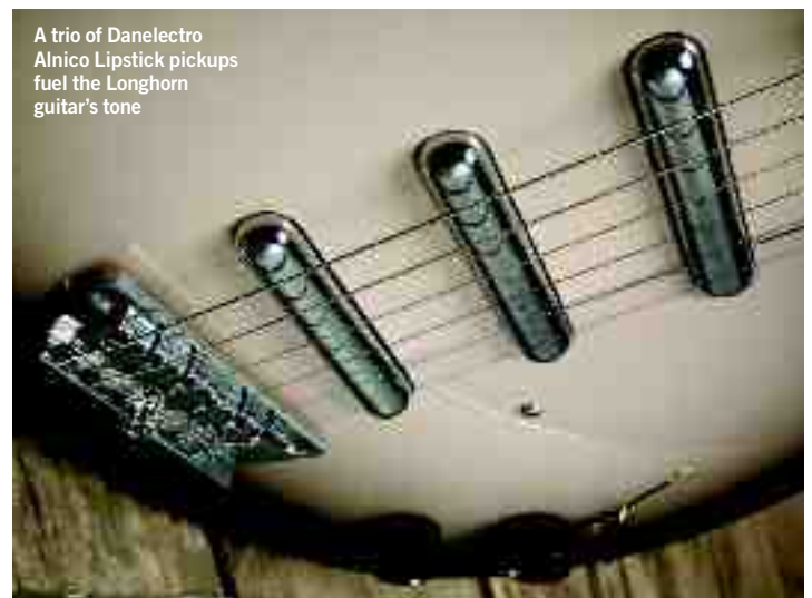
A trio of Danelectro Alnico Lipstick pickups fuel the Longhorn guitar's tone

Again, like the '56 Pro, the headstock shape is a non-symmetrical variation on the classic 'Coke Bottle' outline, which echoed the single cutaway outline of the '56 Pro nicely but doesn't quite complement the symmetry of the