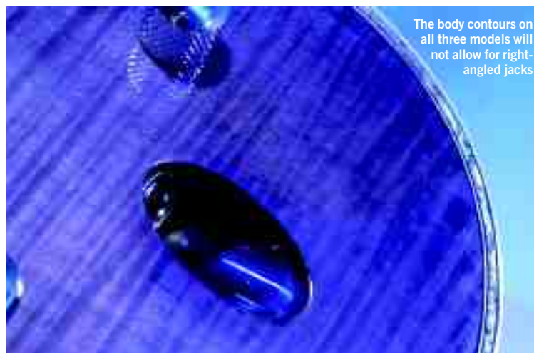
The body contours on all three models will not allow for right-angled jacks

It's good to see a trio of new Ibanez electrics that fly in the face of tradition in that they're perfect for clean and more staid styles