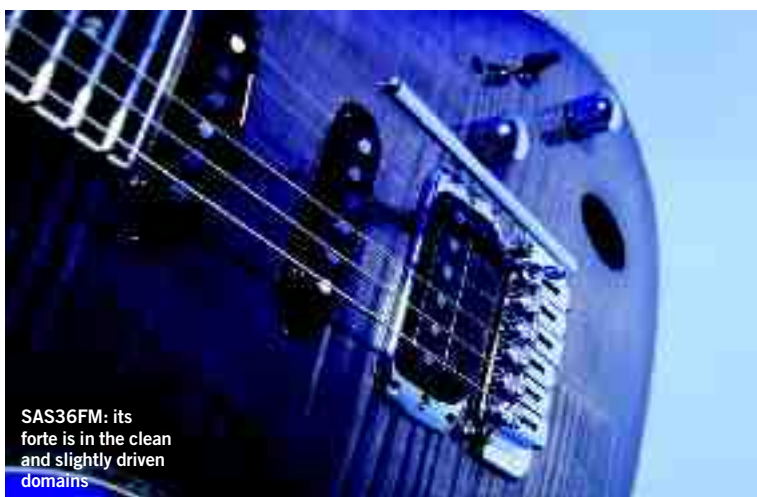
SAS36FM: its forte is in the clean and slightly driven domains

relevant setting of the bridge 'bucker with the inside coil of the AH-3, position three offers both humbuckers, position four the two neck coils and position five the neck in all its glory. The only other difference to point out is the stunning trans lavender blue