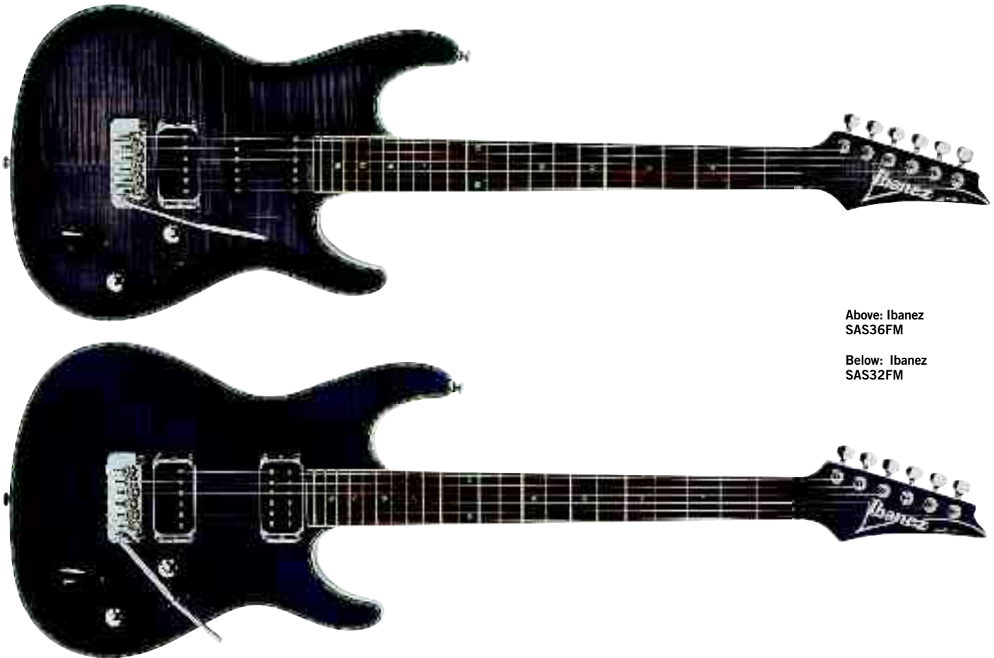
Above: Ibanez SAS36FM