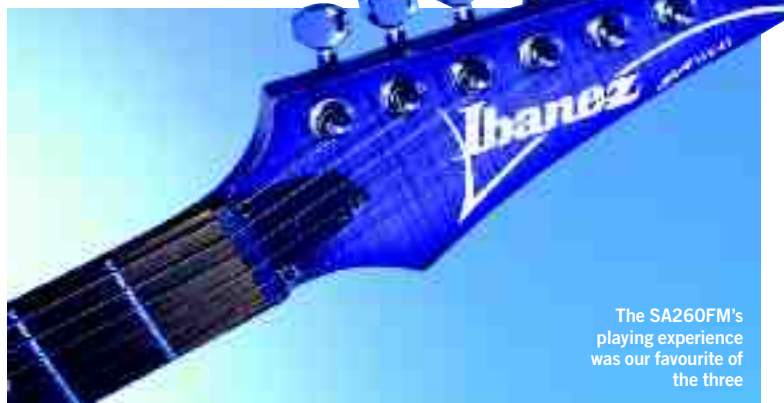
The SA260FM's playing experience was our favourite of the three

As the rear of the neck boasts a matt finish rather than a painted gloss version, the feel is slightly different, and although this isn't meant to voice a positive or negative opinion either way as it's not a relevant criticism, we actually preferred this guitar's playing experience to the previous guitars.