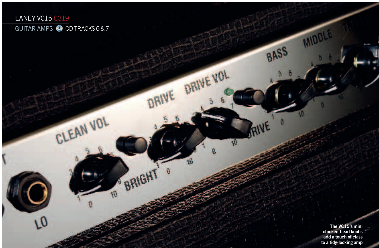
The VC15's mini chicken-head knobs add a touch of class to a tidy-looking amp