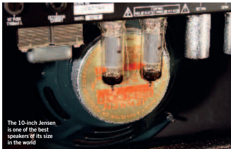
The 10-inch Jensen is one of the best speakers of its size in the world

While only six watts, the Harlequin is the product that rekindled interest in low-output valve combos and so will certainly be on any Laney buyer's shortlist. Its large cabinet and 12-inch Celestion Vintage 30 speaker gives it a big, open sound rarely found in low-wattage amps. The Essex Blonde from Hayden (née Ashdown) is a sweet-sounding, good-looking eight-watt in cream Tolex that shares the VC15's 10-inch driver ethos. Marshall doesn't make a direct rival to the VC30, but the AVT range uses an ECC83 preamp valve to create realistic tones. The great value AVT20 also features a CD input for practice and a speaker-emulated DI output for recording