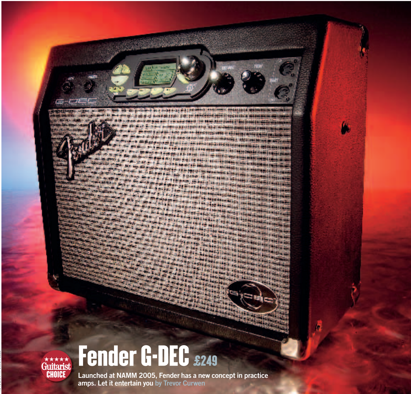
PHOTOGRAPHY SIMON LEE